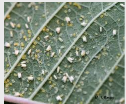
Right: Whiteflies, eggs and nymphs.