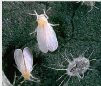
Left: Adult Whiteflies